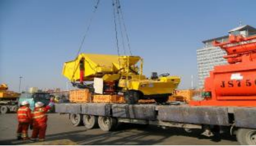
China-Pakistan International Highway KKH Project Phase II