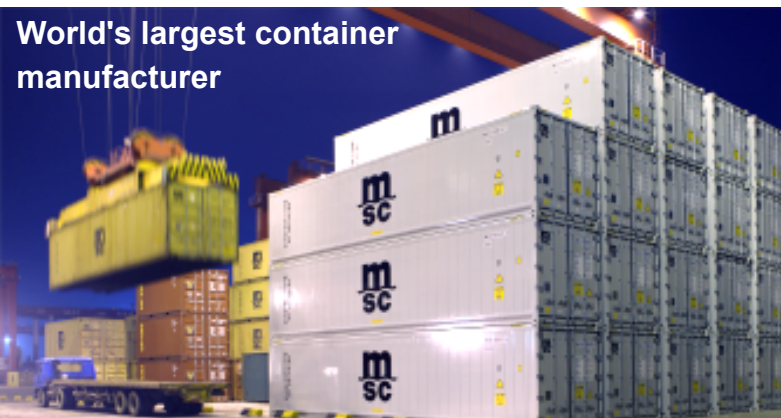
World's largest container manufacturer