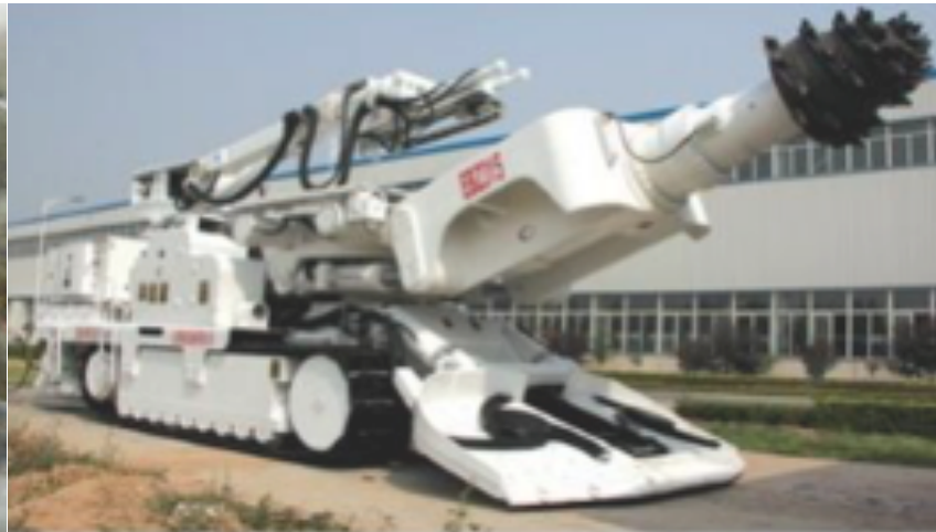
Serbia Zijin MS Copper Mine Construction Project