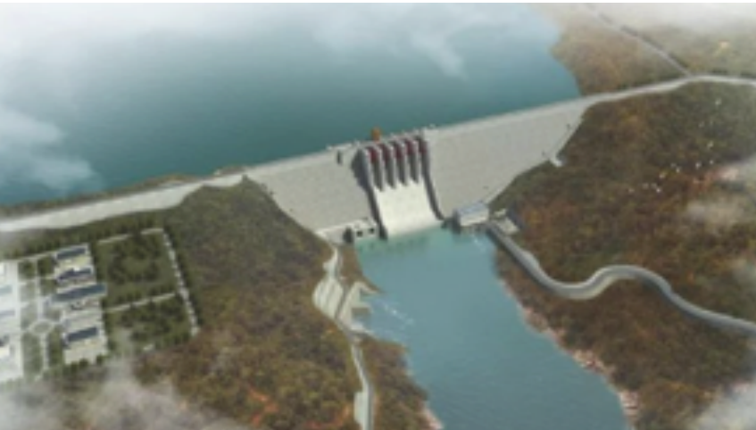
CGGC Angola Kaikai Hydropower Station Project