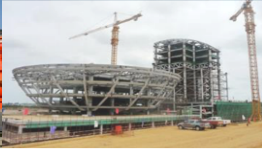
N'Djamena Refinery Project in Chad (PetroChina)