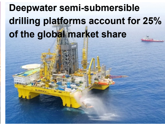
Deepwater semi-submersible drilling platforms account for 25% of the global market share