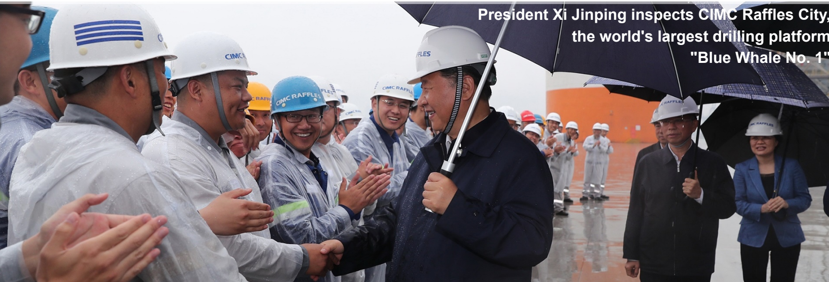
President Xi Jinping inspects CIMC Raffles City, the world's largest drilling platform "Blue Whale No. 1"