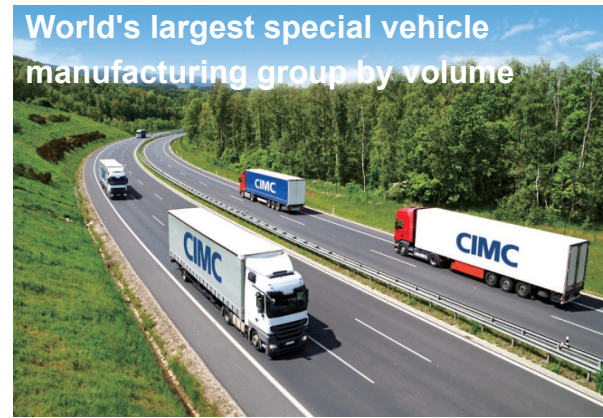
World's largest special vehicle manufacturing group by volume