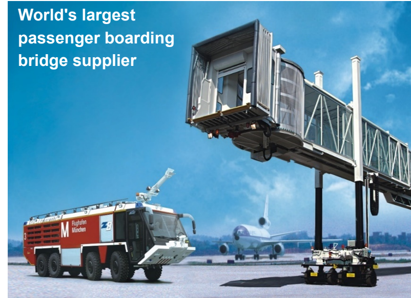
World's largest passenger boarding bridge supplier