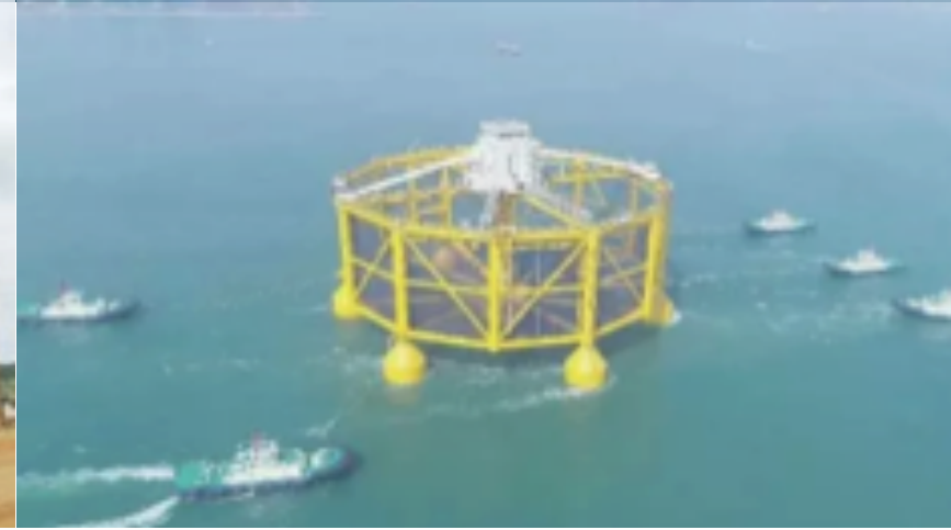
Project "Super Fishery"