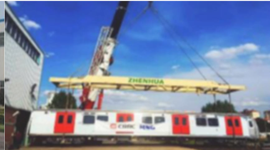
CRRC Turkey Ankara Metro Full Truck Transportation Project