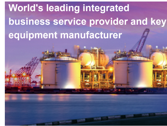
World's leading integrated business service provider and key equipment manufacturer